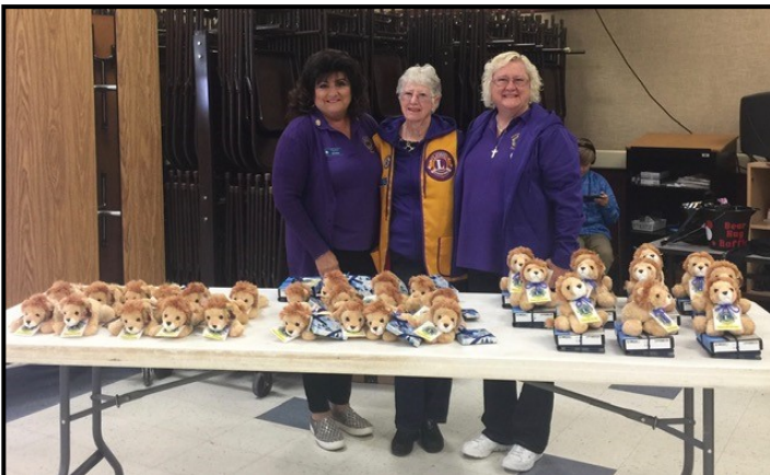
Folsom Lake Lions awarding the Kindles/Lions

Recently, the Penn Valley Hi-Graders Lions Club awarded five graduating seniors with a scholarship from the Walt Becker Memorial Scholarship fund. Each student received a $1,500 scholarship.