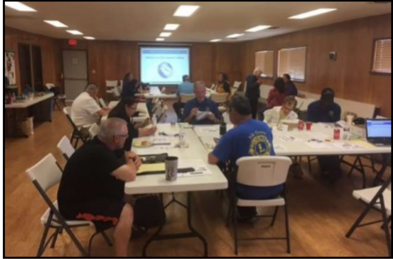
May 25 training session at Roseville Sunrise Lions Clubhouse