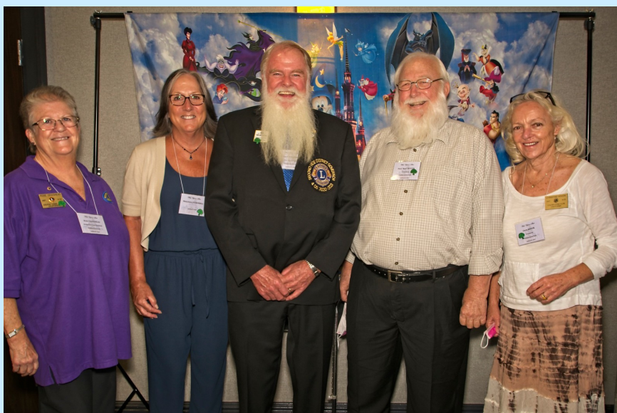
Colfax Lions Club Members