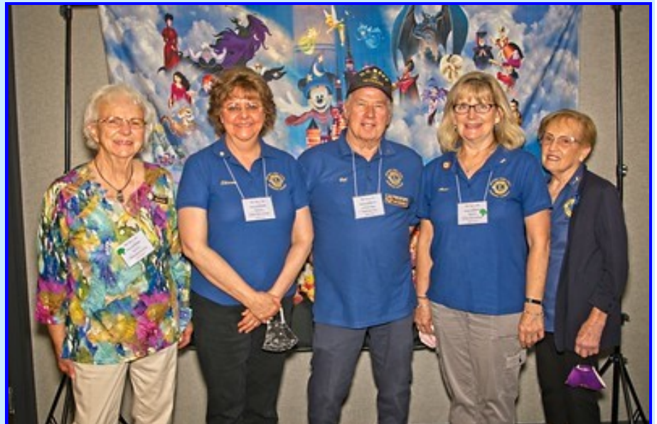
Mother Lode Lions