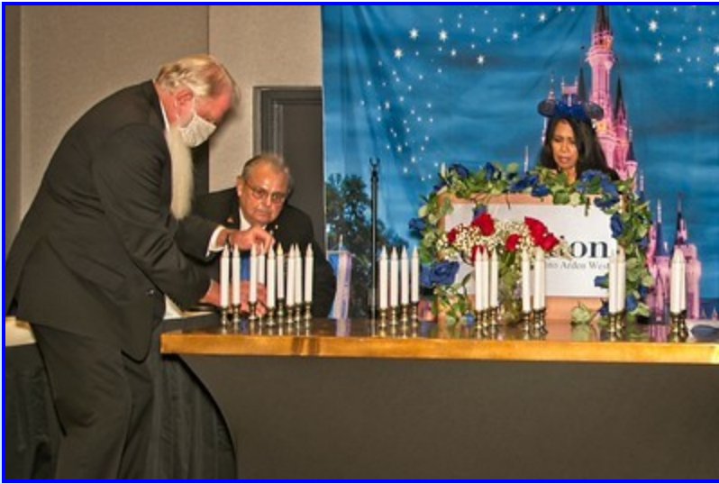
Celebration of Life Ceremony