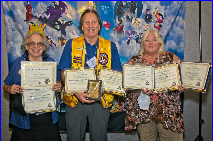
Antelope Lions Club Members