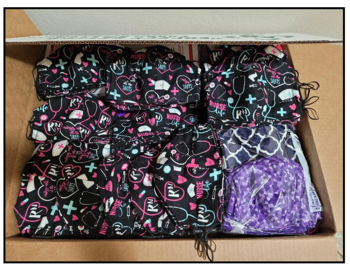
The 3,500 facemasks were donated to frontliners

here in California, Nevada, New York and the other 1,500 was shipped out and donated in Philippines. Since Covid vaccine implementation is already month. Also attached the pictures of nurses and we can make a difference! Proud to be a Lion! doctors with their happy faces, using the first face-