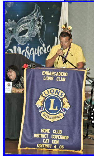
Embarcadero Lions Club