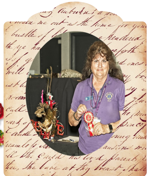
Folsom Lake Lions Club-2nd Place Hard Cover