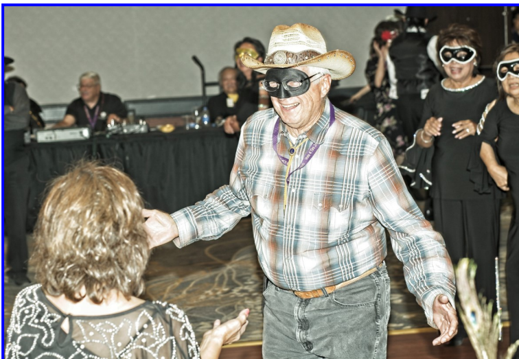
Malaya Lions Club-3rd Place