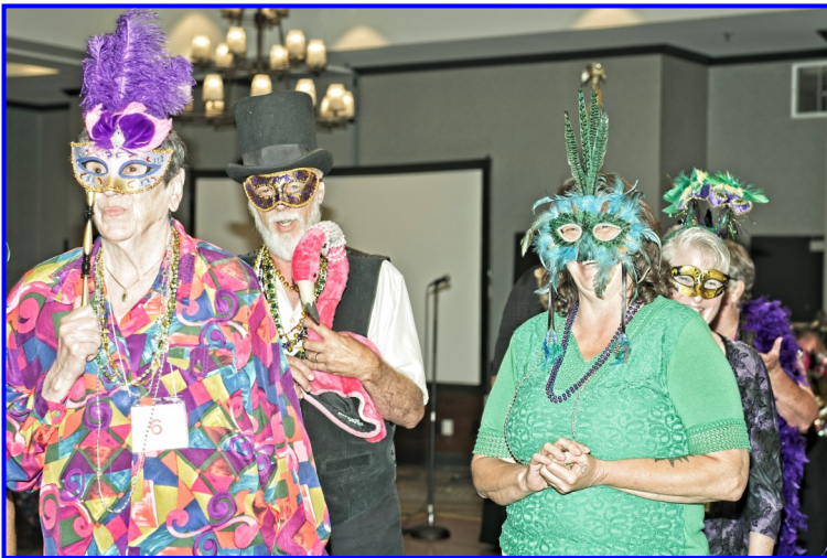
Donner Region—2nd Place