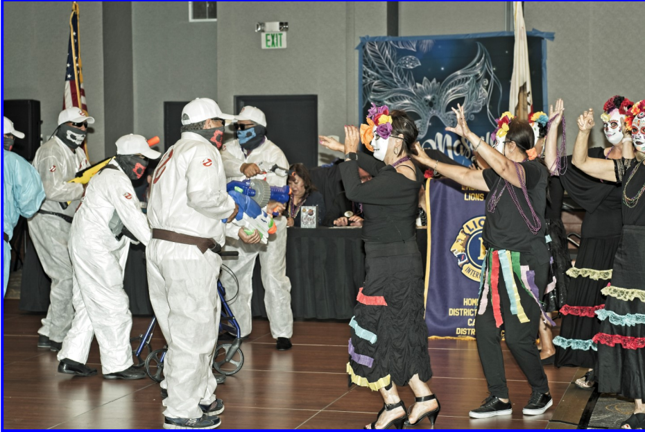
Maharlika Lions Club-1st Place