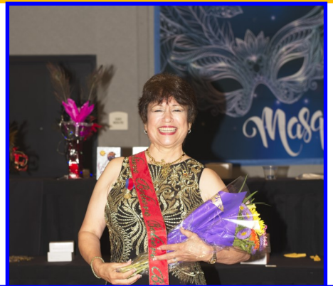
DG Cat presented with bouquet of flowers