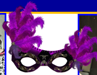
Camellia Lions Club