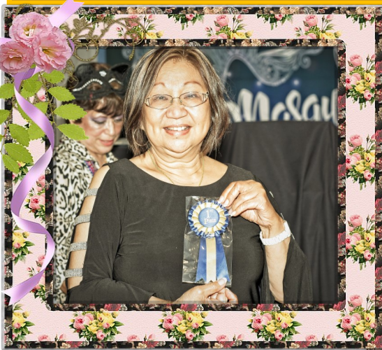
Malaya Lions Club-1st Place Hard Cover