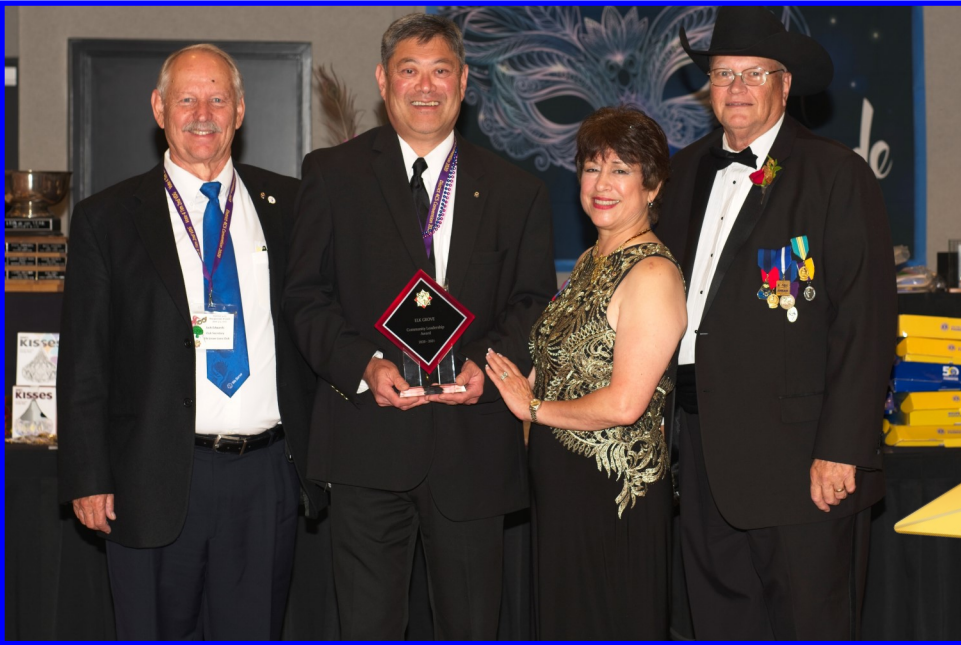
Elk Grove Lions Club

This award is awarded to the club recognized by their own community as Community Leaders. The Club best exemplifies the Motto: Community Service and Community Leadership.