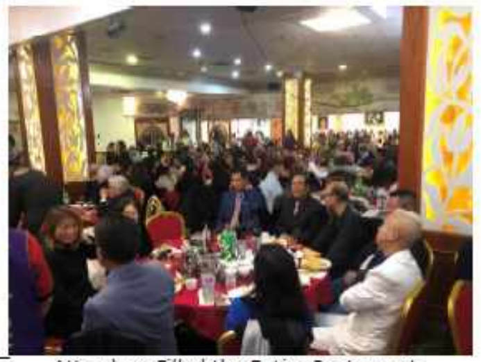
Attendees Filled the Entire Restaurant