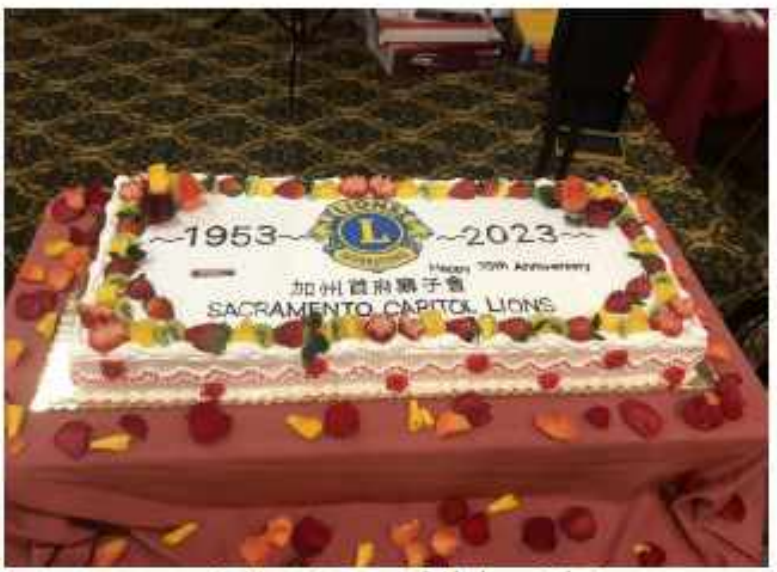
A Very Large Birthday Cake!