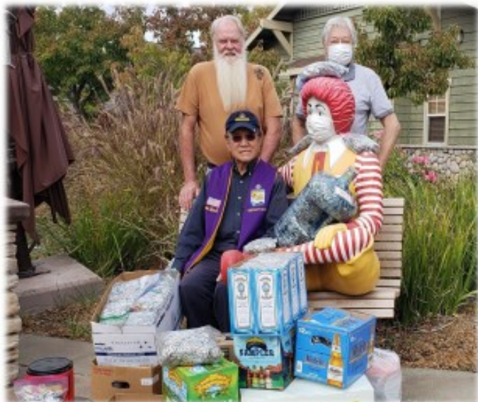
Ronald McDonald House PULL-TAB COMMITTEE at work!

During this, the “Most Wonderful Time of the Year” need is just as