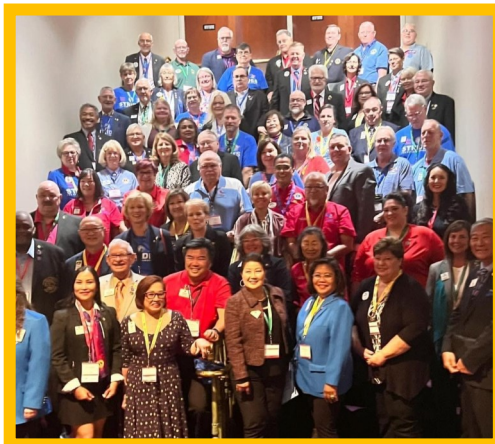
Moderators and Presenters at the Forum.

Can you spot the Lions of District 4-C5?